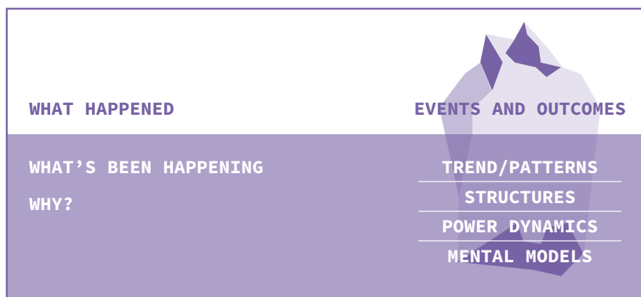
Figure 4: Iceberg

elements. The ‘iceberg’ -model is helpful to direct our focus beyond the visible factors, such as laws and procedures - that are only a small part relevant to change - to the underlying mindsets, attitudes, and cultural patterns etc. 41