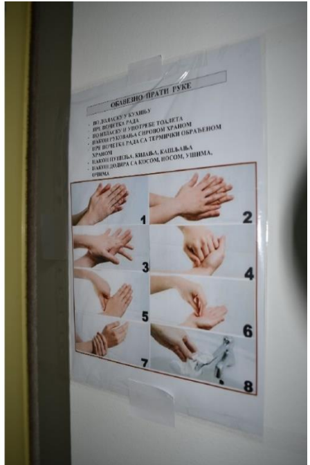
Disease outbreak notification in the Penal-Correctional Institution Belgrade

Visits to convicts were initially limited to 15 minutes and one visitor, with mandatory use of protective masks and gloves, and visits were prohibited as of 30 March 2020. The right of a lawyer to visit his/her clients is exercised with full protective measures, which include a glass or other transparent barrier, as well as mandatory use of protective masks and gloves, and visit time is limited to 30 minutes.