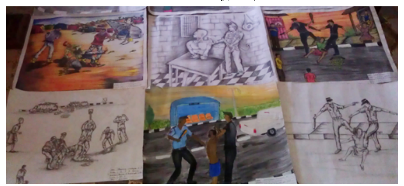
Victims of torture illustrate their harrowing experiences.

The most recognised injuries of a victim of torture in Nigeria are physical wounds, which in most cases are left untreated. While easily identifiable marks left by physical injuries receive attention, little or no attention is paid to other psychological and socio-economic impacts of torture on its victims. Such impacts include loss of employment (caused by inability to perform assigned duties due to sustained injuries), susceptibility to the use of drugs (as a coping mechanism), prostitution, and an inability to function effectively within the society due to trauma or post-traumatic stress disorder.