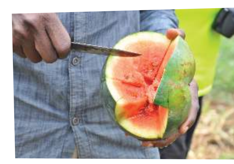
In Rwanda, one watermelon has the same value as 3kg of maize and has become a popular crop for victims to grow and sell.

The centres also helped groups that wanted to sell their produce, by linking them to suitable markets. The centres put them in contact with buyers in larger towns and cities where they could get the best value for their produce.