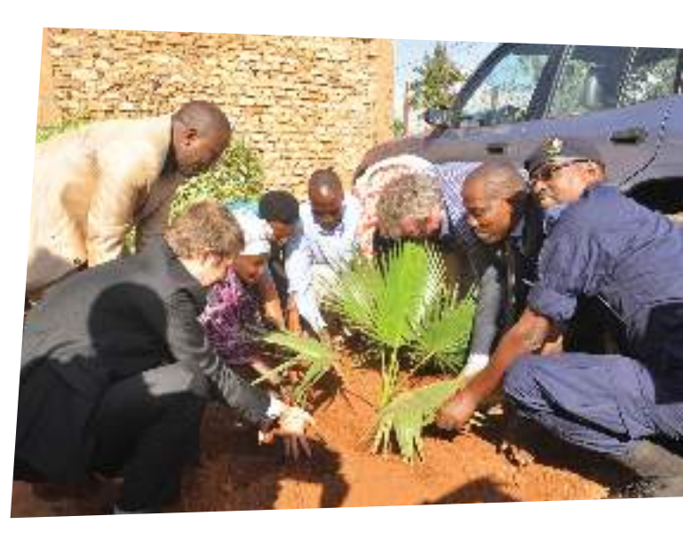
A tree planting ceremony took place in the Ngoma district in Rwanda and was attended by genocide survivors, the chief of police, mayor of the Ngoma district, the EU Ambassador and representatives from the IRCT and ARAMA.

Other reasons for the low number of cases are the cost associated with bringing them to court and victims' reluctance to take on a case due to uncertainty about their future. For example, in cases of domestic violence where the woman has moved to another community to live with her husband's