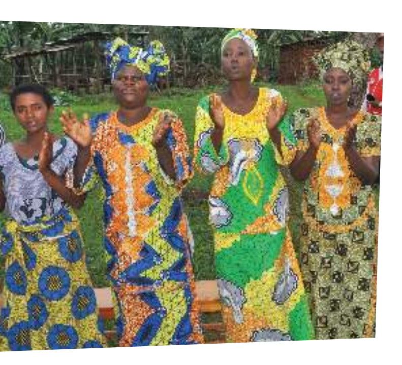
Social counselling groups were typically comprised of up to 15 people from the same village or area.

As part of the project's holistic and community-based approach to rehabilitation, the centres were trained in community-based social counselling. This meant that social counselling could be integrated in existing therapy approaches and interventions.